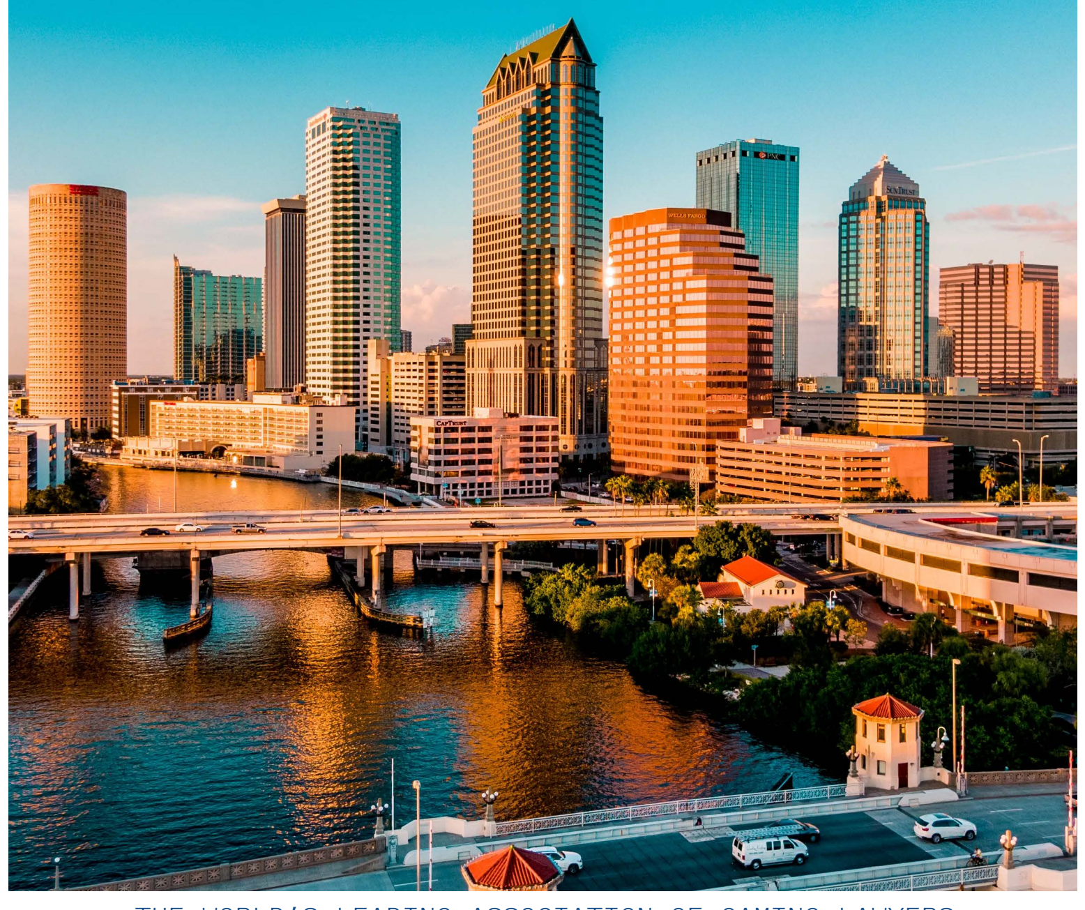
THE WORLD'S LEADING ASSOCIATION OF GAMING LAWYERS

IMGL BIANNUAL CONFERENCES 2024 TAMPA BAY, FLORIDA, USA 10-12 APRIL ROME, ITALY, 22-25 OCTOBER (IN PARTNERSHIP WITH IAGR)