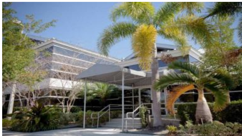
2600 Quantum Blvd Boynton Beach, Florida 33426

600 S. Odessa Avenue Egg Harbor City, New Jersey 08215 More Info Beachway Therapy Center