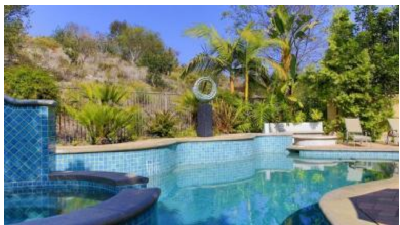
125 B Columbia Aliso Viejo, California 92656 More Info Enlightened Solutions