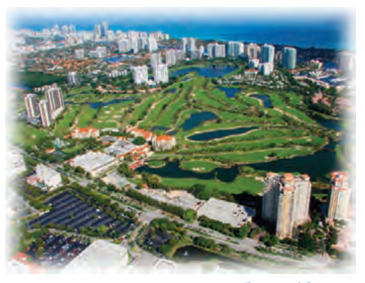
Turnberry Isle Miami Miami, Florida • May 10-12, 2017