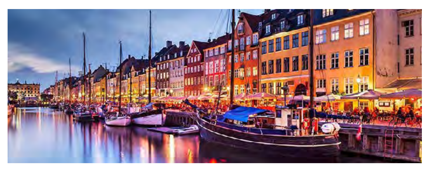
IMGL Autumn Conference • SEPTEMBER 10-12 • Copenhagen, Denmark

Visit the IMGL website for all of the latest conference event information as it is added. For information on sponsorships or speaker opportunities, contact Morten Ronde at morten@imgl.org